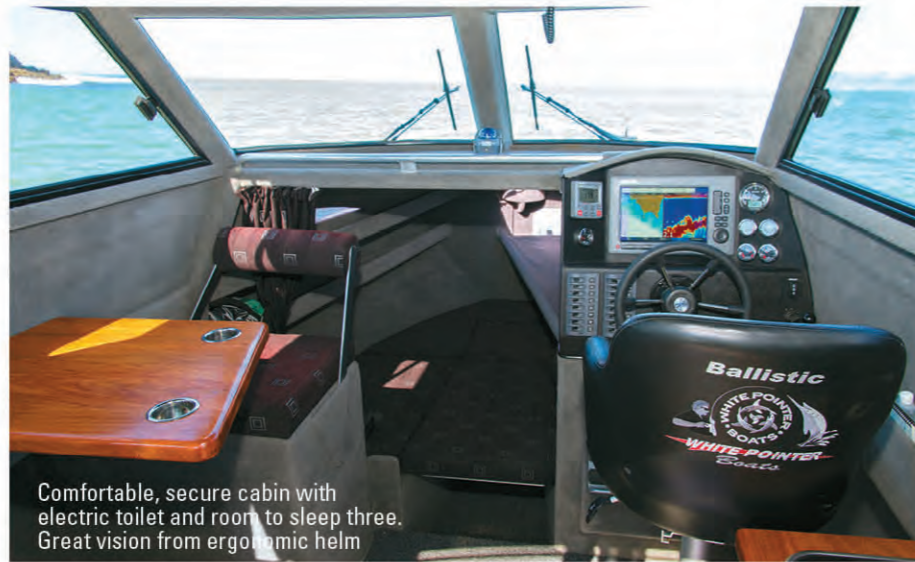
Comfortable, secure cabin with electric toilet and room to sleep three. Great vision from ergonomic helm

A large underfloor kill-tank with custom-made fish bins will take care of the day's catch, while a smaller hatch in the centre means you don't have to lift the whole lid to put a few