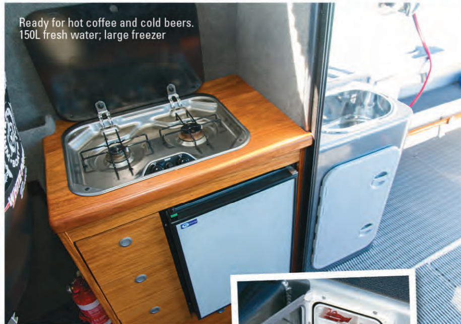
Ready for hot coffee and cold beers. 150L fresh water; large freezer